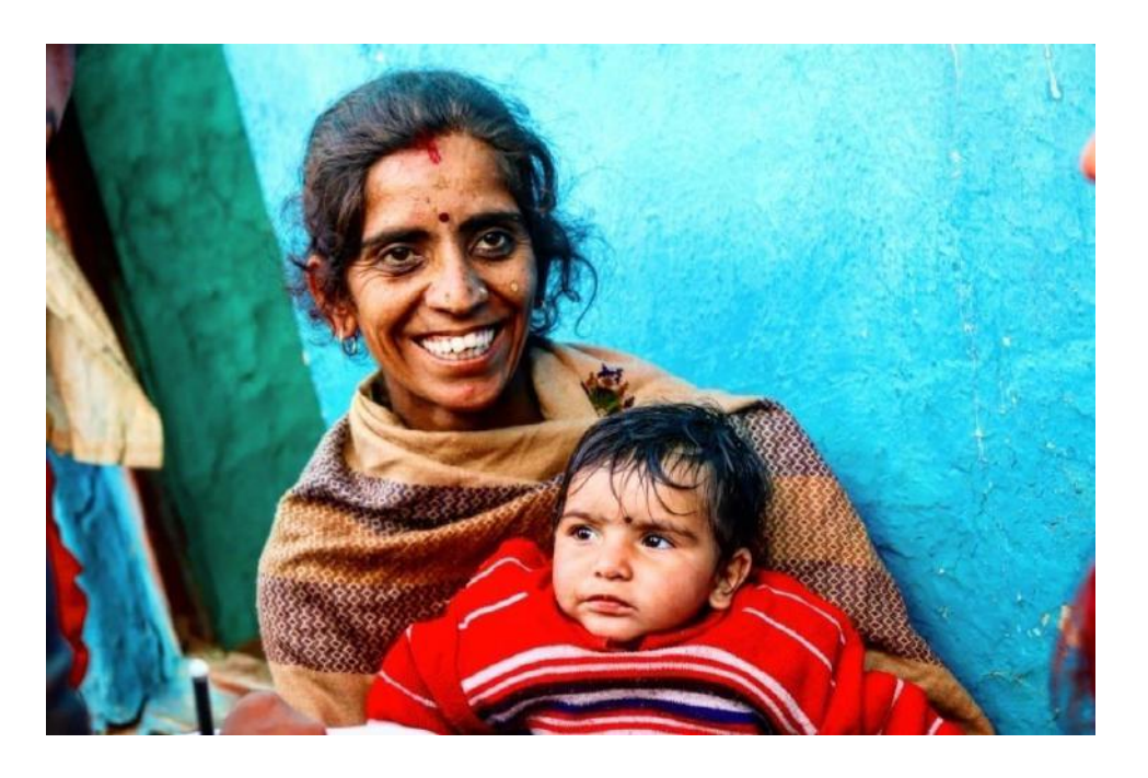
"It's more important to click with people than to click the shutter" (local people of chail)

We finally arrived at our Hotel Jungle Inn which was situated on the top of a hill. We rested for a few hours after the breakfast, and were to leave for the first objective of our Research Survey. It was "Socio Economic situation of households". As we entered the hotel gates at night, in front of us was a magnificent bon fire lit for us and tea and some snacks to compliment it .We went to our respective tents soon to freshen up and gathered again for dinner which was followed by a DJ Night and Bon Fire session again. 17<sup>th</sup> February 2018 our 2<sup>nd</sup> day in Chail, the chilly cold morning welcomed us as we arose in our tents and headed out to see the sunrise spreading beautiful shades on the horizon. We gathered for breakfast and were formed into groups to leave for another village in Chail to complete our second objective of the Research Survey; it was "Farming Practices with special emphasis on organic farming". During the survey, we met the locals of the village and experienced their livelihood first hand they were very welcoming and offered us their farm produce and voluntarily contributed to the survey as well.