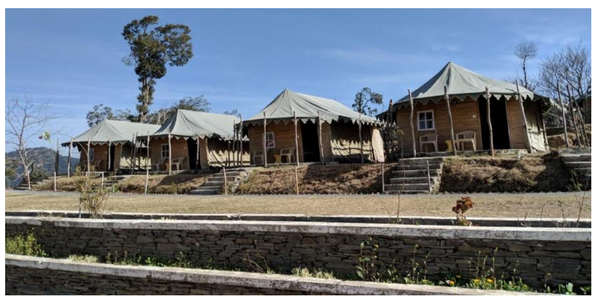
"Hotel Jungle Inn Tents"

"Travelling—it leaves you speechless, then turns you into a storyteller" Henceforth this is a story of our short venture to Chail, a small hill station situated in Himachal Pradesh located at an altitude of 2250 meters. So, as the days went by our teachers in charge summed us up about the tentative plan frame for the trip to Chail. As per the given schedule everyone reported at the college assembly ground at sharp 8:30 pm. In total there were 60 students which included both B.A. Programme students pursuing geography as their Generic elective and the Geography Hons. Students themselves, we were accompanied by our Respected teachers Chetan Chauhan Sir, Bratati Ma'am, Om prakash sir and Joseph sir. After the teacher's made sure every student was seated and that there were enough food and water to supplement us for the trip we set out for our onward journey to chail.