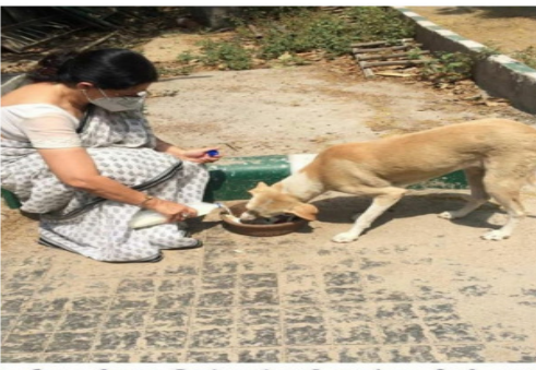
Our dear Principal ma'am fed our adored campus cuties during thes difficult time .