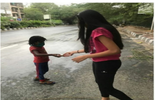
Our volunteer distributed biscuits & other food among her less privileged neighbours.