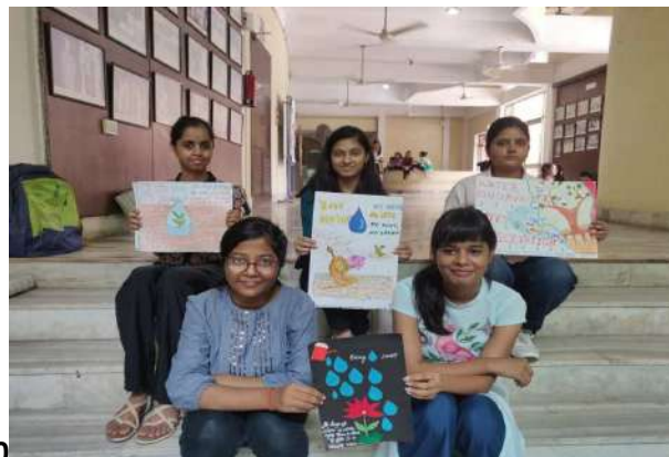
Jal Shakti Abhiyan 2020