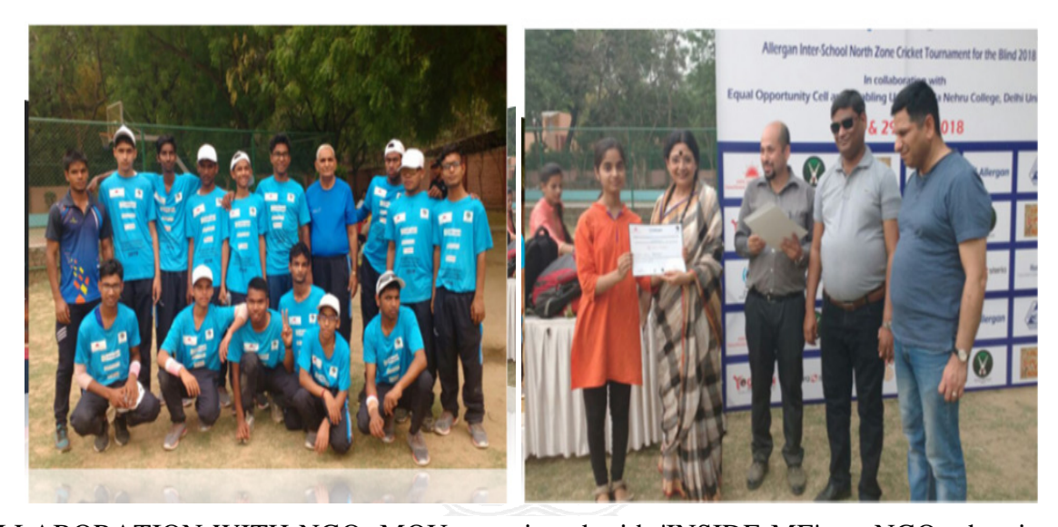
COLLABORATION WITH NGO: MOU was signed with 'INSIDE ME', an NGO wherein our students regularly visit their schools to help them in art and craft.

DEBATE: An entertainment activity was also organized for visually impaired students in the form of cricket match for blind. Also a platform was provided for nurturing their debating skills in the form of "Intra college debate competition".